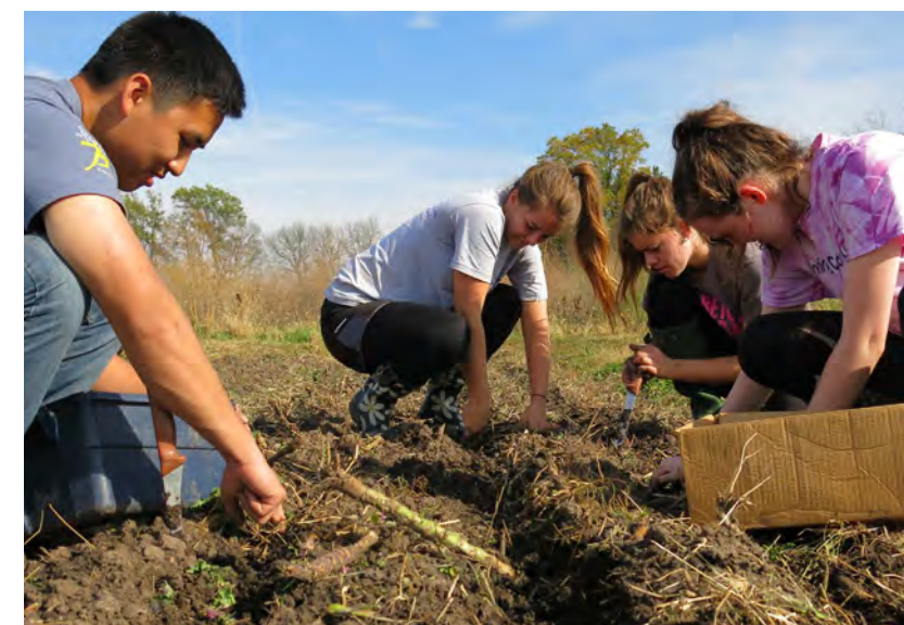
(Above): Catholics joined the People's Climate March in 2017. (Right): Students prepare fields for planting through Creighton's Schlegel Center for Service and Justice.